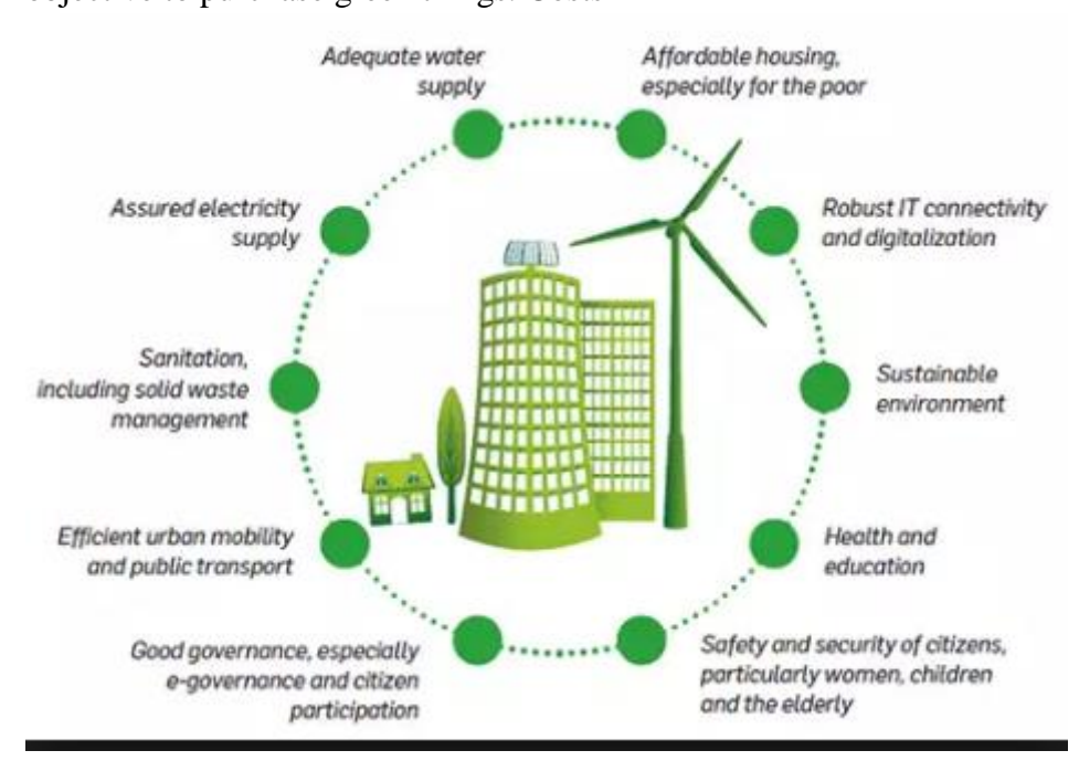
Figure 1: Green Marketing

A lot of composing is open as for green advancing, green things and purchaser care with respect to green things and perspective on green things independently. There are several examinations of combined undertakings concerning purchaser care and perception with respect to green things: Rex (2007) found that green exhibiting could take in package of things from normal publicizing in finding unexpected strategies in comparison to naming to propel green things like watching out for a progressively broad extent of buyers, working with the arranging techniques of significant worth, spot and headway and successfully charming in market creation. Hassock (2008) sent in Marketing Daily that "the power of green lies in sponsors' grip". It was not originators, legitimate consultants or officials that had the most ability to clean up the earth. The inventive individuals who can structure and propel cleaner things and advancements and help purchasers create to continuously conservative lifestyles. An investigation of the customers who had experienced getting green or natural things in Taiwan and found that green thing quality and green corporate picture could bring green buyer devotion and green customer unwavering quality. Ali (2011) surveyed the green purchase disposition and found that there are various customers who have positive and high objective to purchase green things. Costs